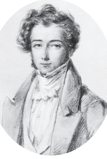
Alexis de Tocqueville published his insightful observations between 1835 and 1840 from his visit to the United States.

But you may be asking yourself, "Why would a homeschool advocate oppose a savings account for education?"